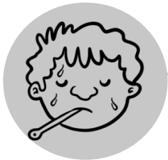
Fever and Chills

Symptoms of anthrax depend on how a person becomes infected. All types of anthrax can spread throughout the body if untreated. Anthrax can cause serious illness or death. Symptoms can show up 1 day to more than 2 months after infection. Common symptoms include: