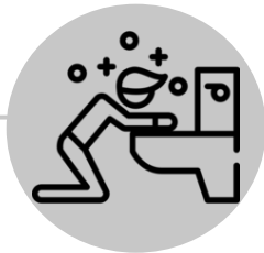
Nausea and Vomiting