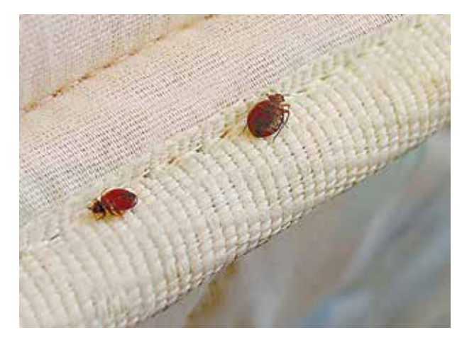
The bed bug is "one of the smartest bugs. It hides and waits for you, then smells your breath, like someone just lit up the barbecue grill."

"The stories are endless. People burn their houses down to get rid of bed bugs. People sleep in bathtubs. Kids are sent home from school with their coats in plastic bags," he says. Mallory lives in Cincinnati, the most bed bug-infested city in the coun-