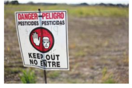
Legislators are considering adding an exception to Connecticut's 2010 ban on pesticide use at schools.

The 2010 law eliminated synthetic pesticide applications (http://www.ct.gov /dph/lib/dph/environmental_health/eoha/pdf /turf_mgt_without_pesticides.pdf) on the grounds of day cares and K-through-8 schools. Supporters say the ban was in response to concerns about children's health and the environment. For years, towns like Cheshire and Branford have been pesticide-free, treating their municipal fields with only organic products.