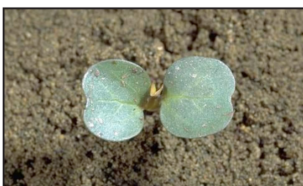
Figure 2. The first two leaves (cotyledons) of a field bindweed seedling are notched.