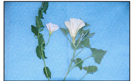
Figure 6. Field bindweed (left) and the larger flowers of western morningglory (right).

Three practices can reduce the possibility of introducing field bindweed—purchase and plant clean seed and ornamental stock, remove any seedlings before they become perennial plants, and prevent any plants from producing seed. If topsoil is introduced to a site, it should be free of roots, rhizomes, seeds, and other