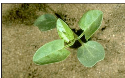
Figure 3. Field bindweed seedling.

are larger and vines more robust than under drought conditions.