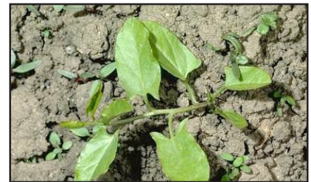
Figure 7. Field bindweed plants developing from underground roots or rhizomes don't have seed leaves.