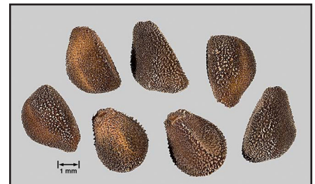
Figure 8. Field bindweed seeds.

bindweed propagules. It is important to control new infestations when they are small, because spot control is the least expensive and the most effective strategy.