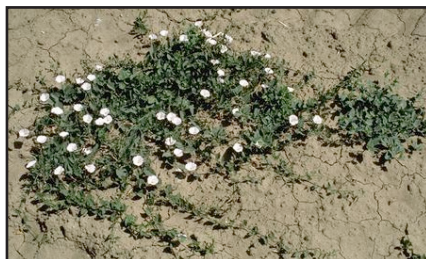
Figure 1. Field bindweed.

Field bindweed is a prostrate plant unless it climbs on an object for support. It often is found growing on upright plants, such as shrubs or grapevines, with its stems and leaves entwined throughout the plant and the flowers exposed to the light (Fig. 4). Under warm, moist conditions, leaves