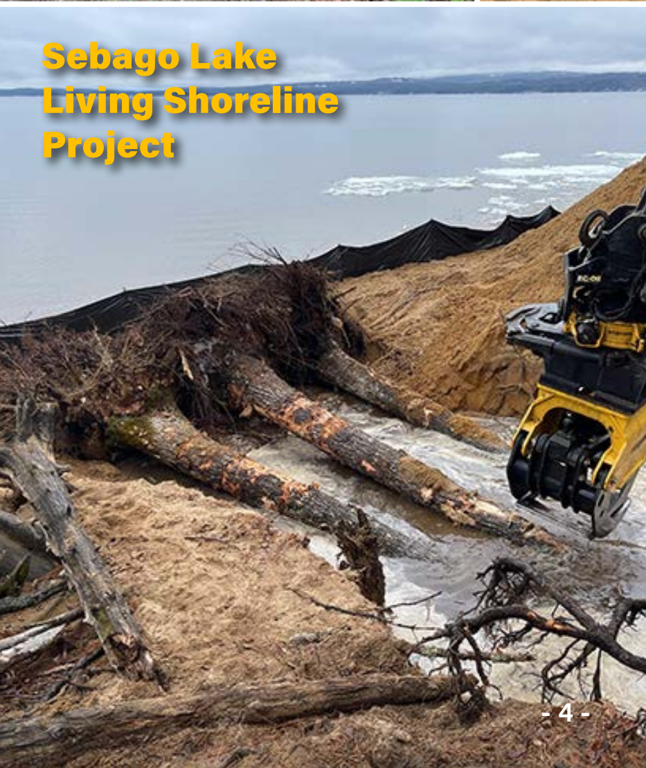
Sebago Lake Living Shoreline Project