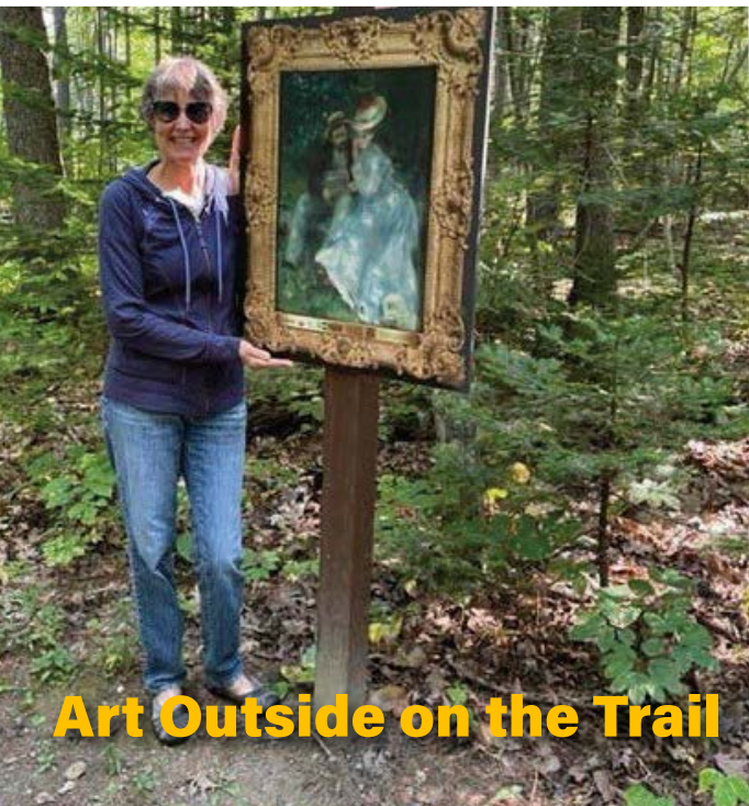
Art Outside on the Trail