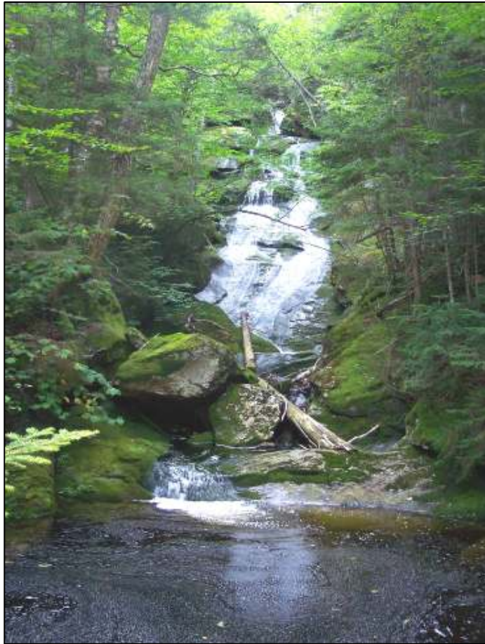
Goose Eye Brook, Mahaosucs