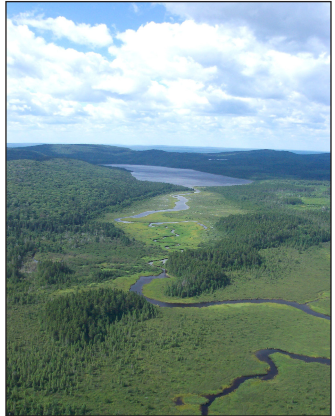
St. John Wetland, Maine Natural Areas Program

communities. This is a peatland system that occurs in environments with surface or groundwater flow, as opposed to closed basins. This ecosystem can include both bog and fen communities, but the more diverse fen vegetation is dominant.