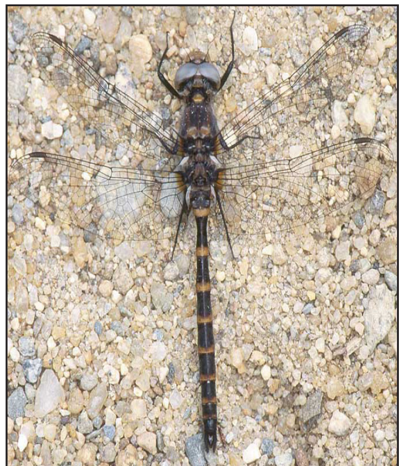
Ringed Boghaunter