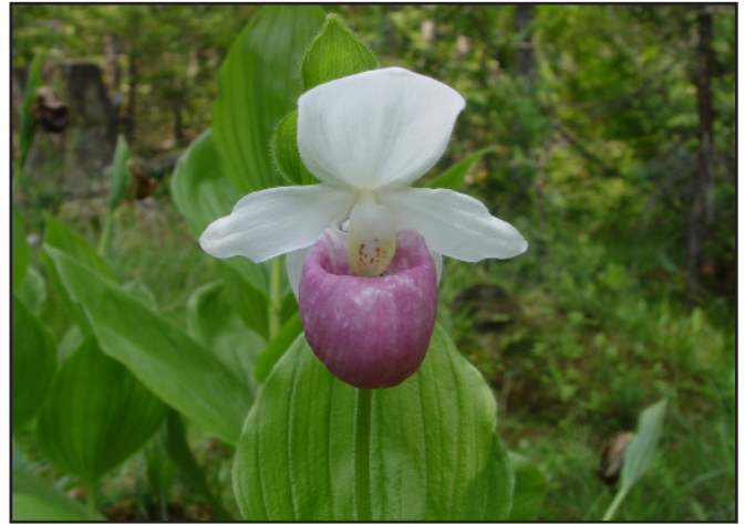
Showy Lady's-slipper

Because orchids are very popular with some specialty gardeners, many naturally occurring orchids are threatened by collection from the wild. This rare species is difficult to propagate, putting it at increased risk from uneducated or unscrupulous collectors. Gardeners should be aware that plants offered for sale have almost certainly been dug from the wild, threatening the survival of this species in nature. Other risks to this species include habitat loss from heavy timber harvest. Partial canopy removal can benefit this species, if done carefully.