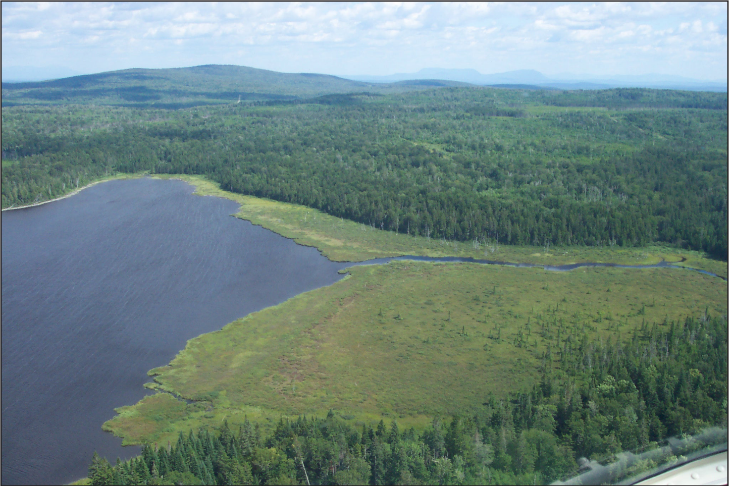
St. John Pond, Maine Natural Areas Program