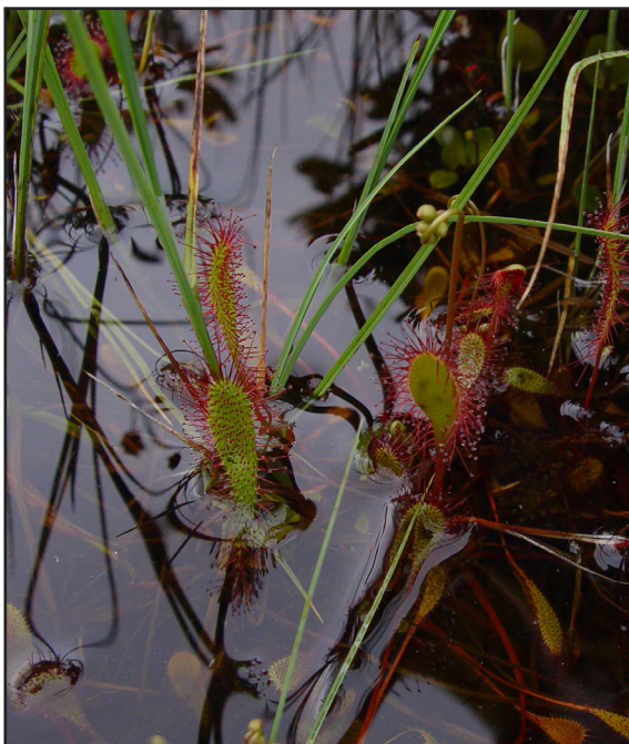
English Sundew, Maine Natural Areas Program