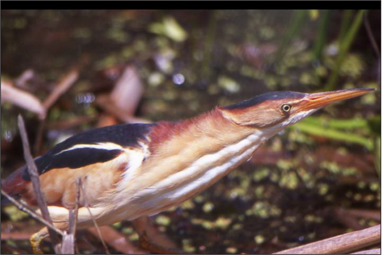
Least Bittern