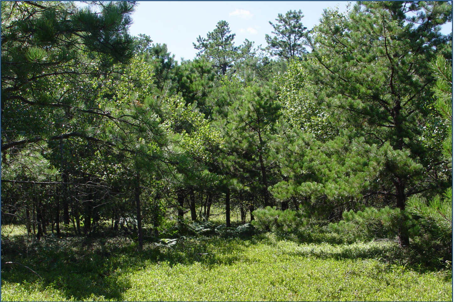
Pitch Pine Scrub Oak Barren, Maine Natural Areas Program