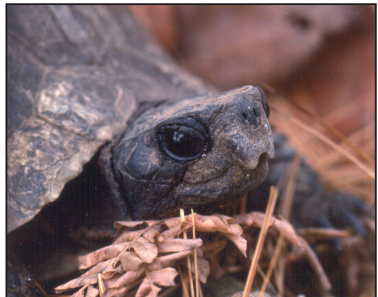
Top: Sleepy Dusky wing, Erik Nielson Middle: Ribbon Snake, Jonathan Mays Bottom: Wood Turtle, MDIFW

succeed to more mesic forest types dominated by red and white oak, and white pine. Only those sites that are the most xeric or frost prone will likely maintain pine barrens habitat. A loss of pine barrens community types will lead to a loss of habitat for pine barrens dependent moths and butterflies. Small pockets of barrens may persist, but the distribution of these pockets may not be adequate to maintain the viable populations of these species. In addition, habitat for rare barrens flora may be lost. It is likely that the Killick Pond Barrens will eventually burn again in a catastrophic