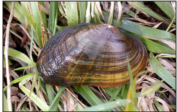
Top Silver Maple Floodplain Forest, Maine Natural Areas Program Bottom: Brook Floater, Ethan Nedeau

rare animal species, the brook floater ( Alasmidonta varicosa ), a freshwater mussel, and the wood turtle ( Glyptemys insculpta ). Brook floater mussels have experienced significant declines throughout their range, with many populations being extirpated. Even where it is found, the population often consists of just a small number of individuals. Maine has more populations of this threatened species than the remainder of the Northeast combined and is, therefore, important for this species' conservation. Wood turtles, a primarily northeastern species listed as a species of Special Concern in Maine, are also declining throughout their range. Maine, however, likely hosts some of the largest and most viable remaining populations in the U.S.