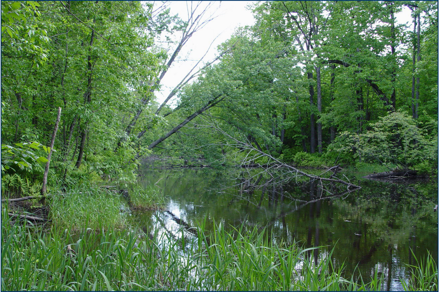
Weston Island, Maine Natural Areas Program