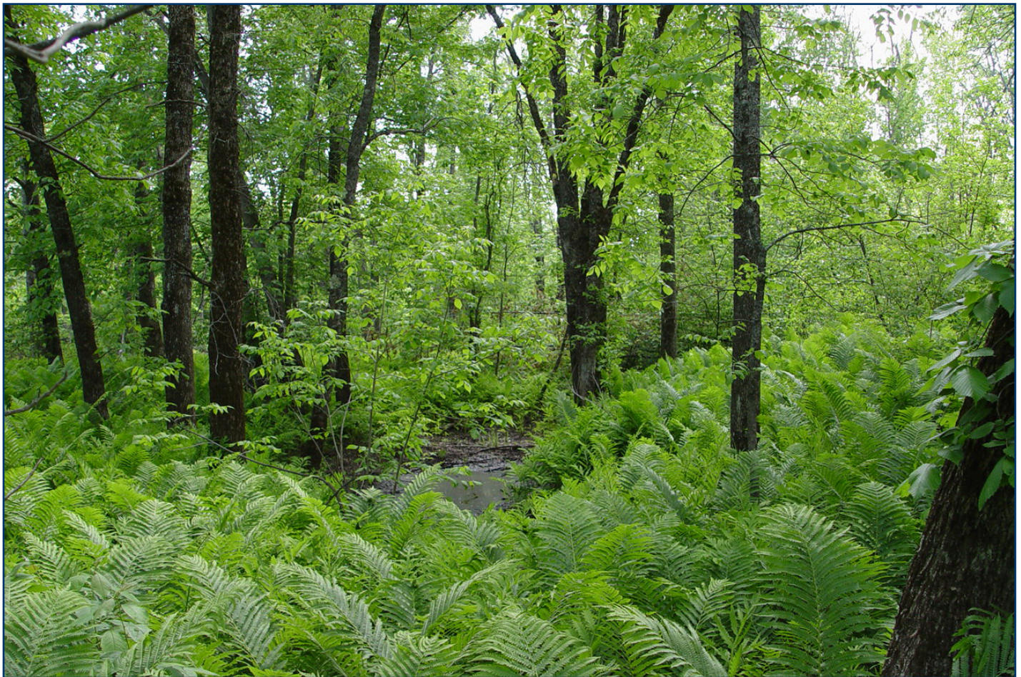
Weston Island, Maine Natural Areas Program