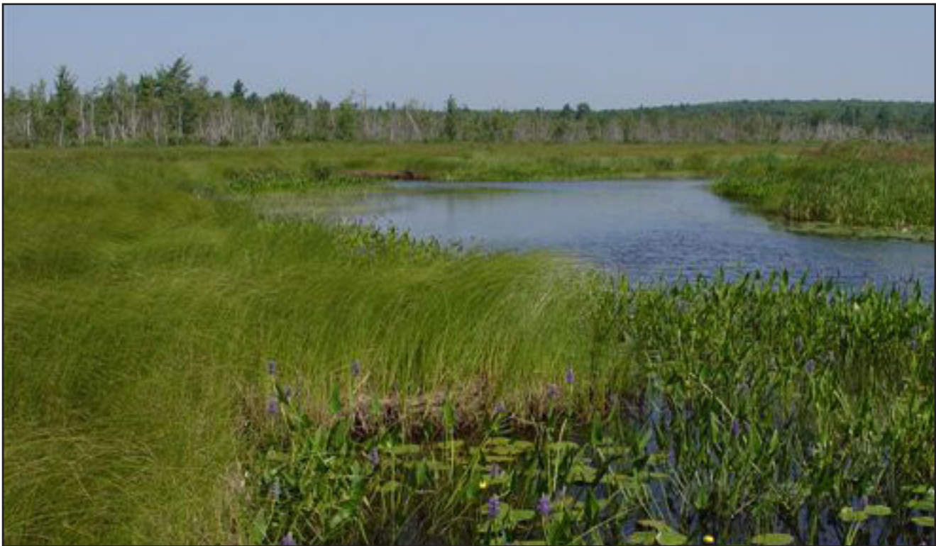
Dwinal Pond Stream, Maine Natural Areas Program

For more information about Focus Areas of Statewide Ecological Significance, including a list of Focus Areas and an explanation of selection criteria, visit www.beginningwithhabitat.org