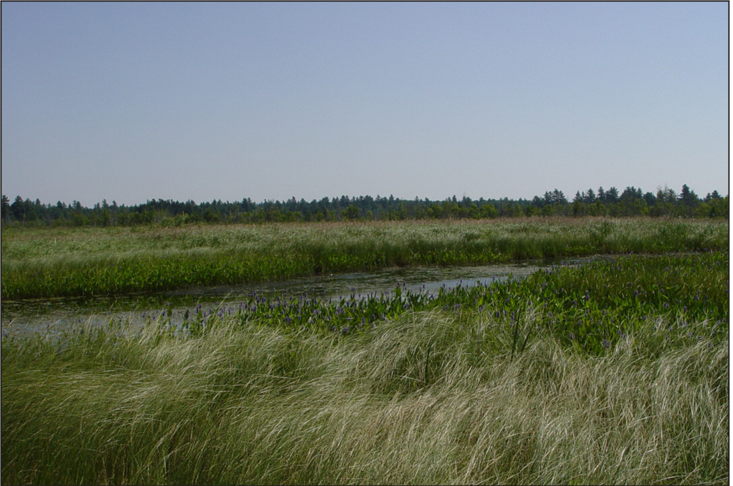
Dwinal Pond Sedge Meadow, Maine Natural Areas Program