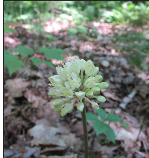
Wild Leek, Maine Natural Areas Program