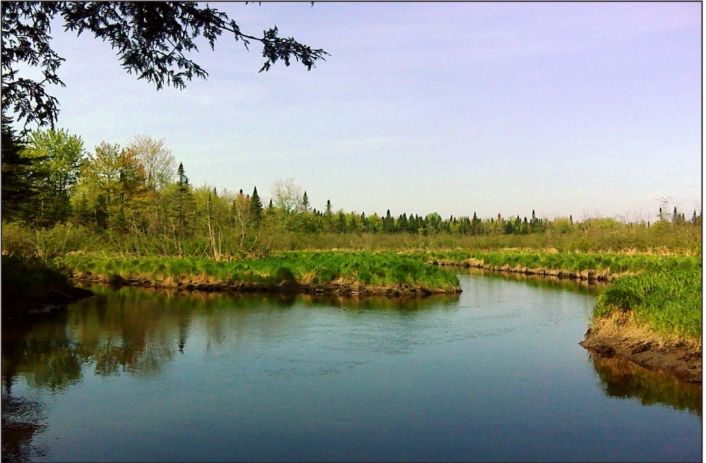
Alder Stream, Maine Natural Areas Program