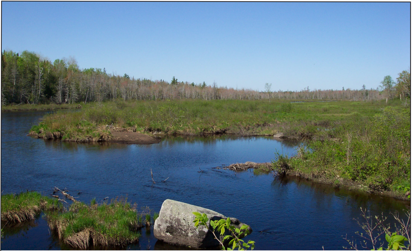
Alder Stream and Wetlands, Maine Natural Areas Program

For more information about Focus Areas of Statewide Ecological Significance, including a list of Focus Areas and an explanation of selection criteria, visit www.beginningwithhabitat.org