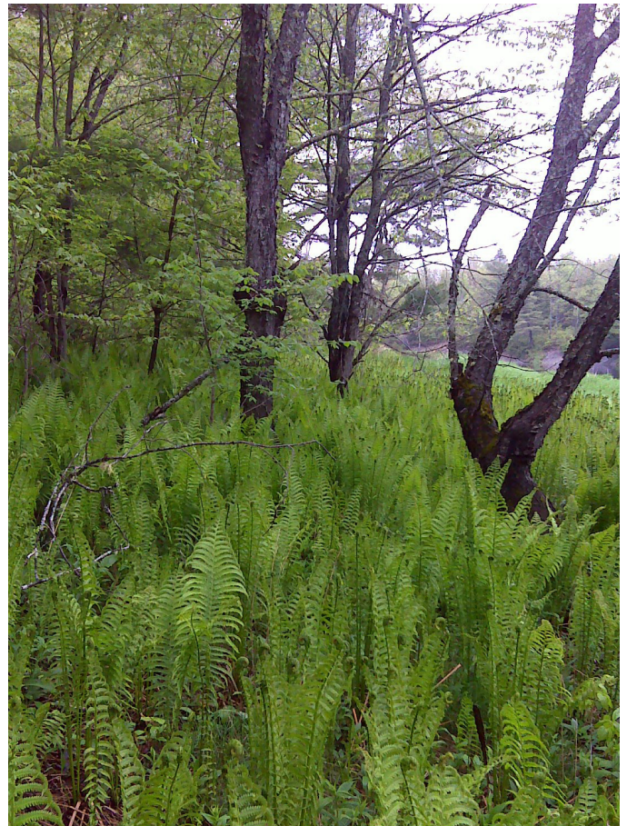
Alder Stream Wetlands, Maine Natural Areas Program