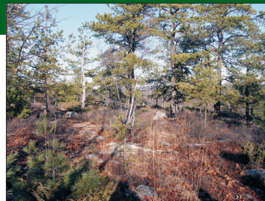
Pitch Pine Woodland

This community appears to be relatively stable in Maine, with little habitat conversion. Fire has apparently played