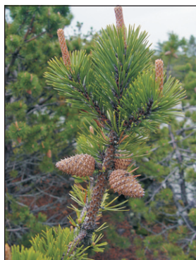
Pitch Pine Cones