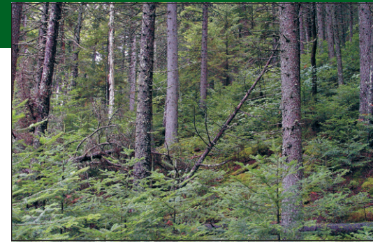
Montane Spruce - Fir Forest