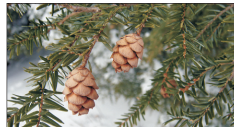
Hemlock Branch with Cone

This community type may be used as nesting habitat by a number of coniferous forest