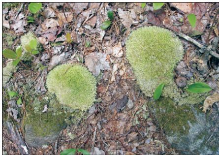
Pin Cushion Moss

Hemlock forests are usually on slopes (typically 5-50%) and ravines, with well drained loamy soil. On lower slopes and flats, soils may grade to imperfectly drained. Soils tend to be shallow (<50 cm) and acidic (pH 4.8-5.6). Sites are from sea level to 1200' and often in cool microsites, although aspect varies.