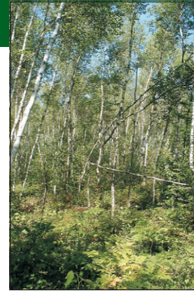
Early Successional Forest

Woodlands can be strongly deciduous and can resemble this type, but red oak cover exceeds that of birches, aspen, and red maple combined.