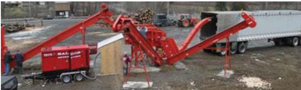
A woodchip screener used to remove over-sized woodchips and fine dust from the bole chips before they are loaded into a trailer for delivery to a woodchip heated facility.

As demand for quality woodchip heating fuel has grown in the last few years, an increasing number of logging and chipping contractors have made considerable investments in equipment to provide the growing woodchip heating market with a high-quality, reliable supply of fuel. For example, a handful of woodchip suppliers in the region have recently invested in screening equipment to produce a higher quality, more consistent, bole woodchips.