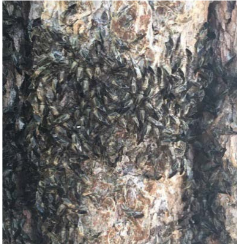
Image: Adult barklice photo sent in by a homeowner in Belgrade. Used with permission

We have received many reports of “mystery insects” on the bark of trees and have had a few samples come into the lab. The small, soft bodied mystery insects, shown in the image, are barklice. Interestingly, they are indeed related to the lice people get in their hair, although distantly and pose no problems for humans. Barklice are completely harmless and actually benefit the tree by consuming detritus and other organic bits found on tree bark, especially on maples. Think of them as little herds of buffalo roaming and grazing the vast plains of tree trunks. There are many species of barklice in Maine, however C. venosus is probably the most conspicuous and therefore the most often seen. These barklice appear in July as patches of tiny tan specks on the bark of various hardwoods and conifers. Juveniles are striped and wingless, and adults have dark smoky-gray wings with a triangular light spot on each forewing. In late summer, adult females will deposit their eggs singly or in small clutches on the bark covering each mass with a series of tiny silk strands. These egg masses will overwinter until emergence next year. Barklice usually disappear from trees soon after they develop wings in mid-to late-August.