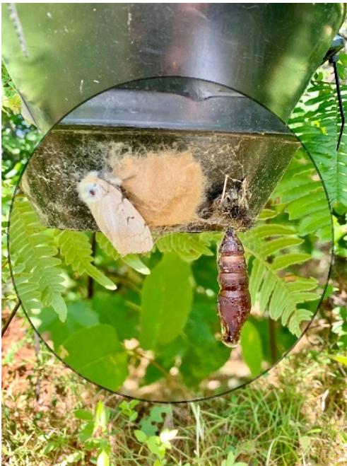
Image: An empty gypsy moth pupal case and newly emerged female gypsy moth depositing a fresh egg mass on an MFS funnel trap. MFS

The influx of calls caused by mature gypsy moth caterpillars last month has now been replaced with reports of abundant male moths flitting around while female moths are busy depositing egg masses on trees and other objects. As reported last month, weather patterns in 2020 have likely led to increased caterpillar survival and bolstered the background population level of gypsy moth around the state. Reports from new areas will help allocate survey efforts for gypsy moth egg masses, now that oviposition has occurred, we welcome reports of abnormally high numbers of egg masses for our records.