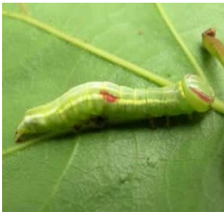
Image: Saddled prominent larva.

The saddled prominent is an important hardwood defoliator that may cause significant damage to the forest resource. Larvae defoliate hardwood stands through the month of July and into early August. Beech and sugar maple are the preferred hosts, but birches and oaks may also be defoliated. Two successive years of severe defoliation may cause some dieback or tree mortality of already weakened trees on poor sites. Outbreaks appear suddenly and do not seem to follow any particular cycle. However, heavy infestations usually subside after one or two years in any one location. Natural control factors such as starvation, disease, parasitism, and predation combine to bring about a collapse of these outbreaks.